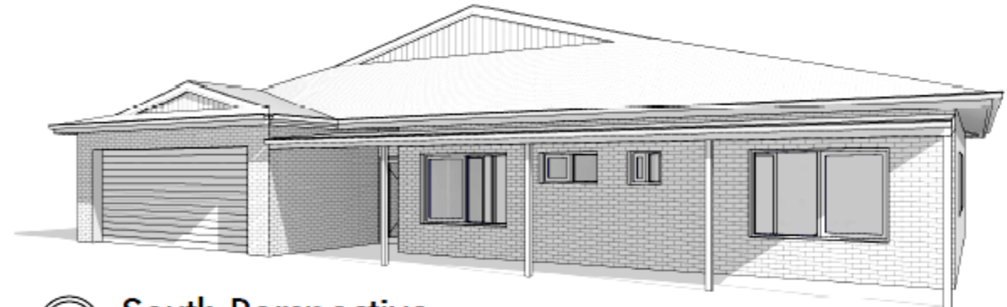
② South Perspective