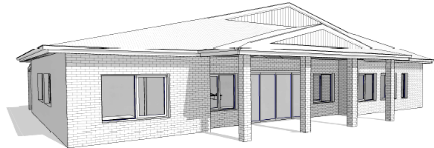
③ North Perspective