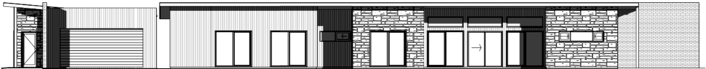
③ Street Elevation 1 : 100